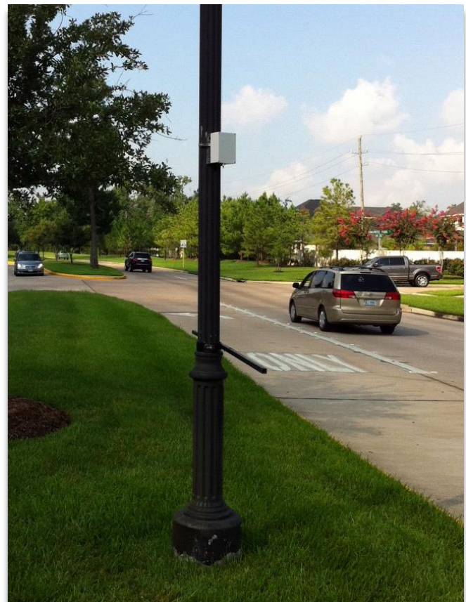
Armadillo mounted on light pole collecting data