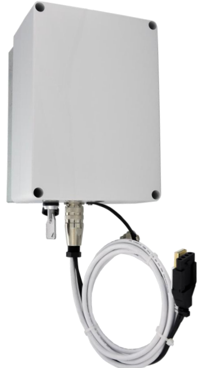
Armadillo Tracker Radar Stats Collector