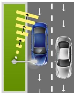
Armadillo on the side with 2 lanes incoming. No outgoing lanes can be detected